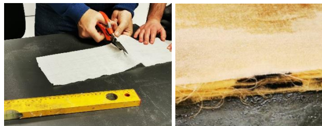
Figure 1. The biocomposite material preparation (left – cutting the woven fabrics; right – the biocomposite material layering)

The study was made for four types of biocomposite hybrid materials with fibers of wool, wool & cotton, bamboo and bamboo & cotton. The used resins were formed of 50% of epoxy – Resotech 1050 and 50% dammar.