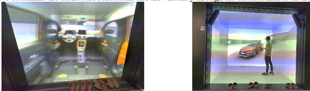
Figure 3. The realistic images of the studied model

All the components were assembled, obtaining a 3D realistic model (Figure 3 – left side). With the CAVE is possible to simulate different status of the light like sunrise, middle day, sunsets with all the sun positions – front, back, lateral. It was possible to simulate the tunnel entrance/exit or midnight all of them to determine the dashboard reflections and the visibility through the exterior mirror on the left side.